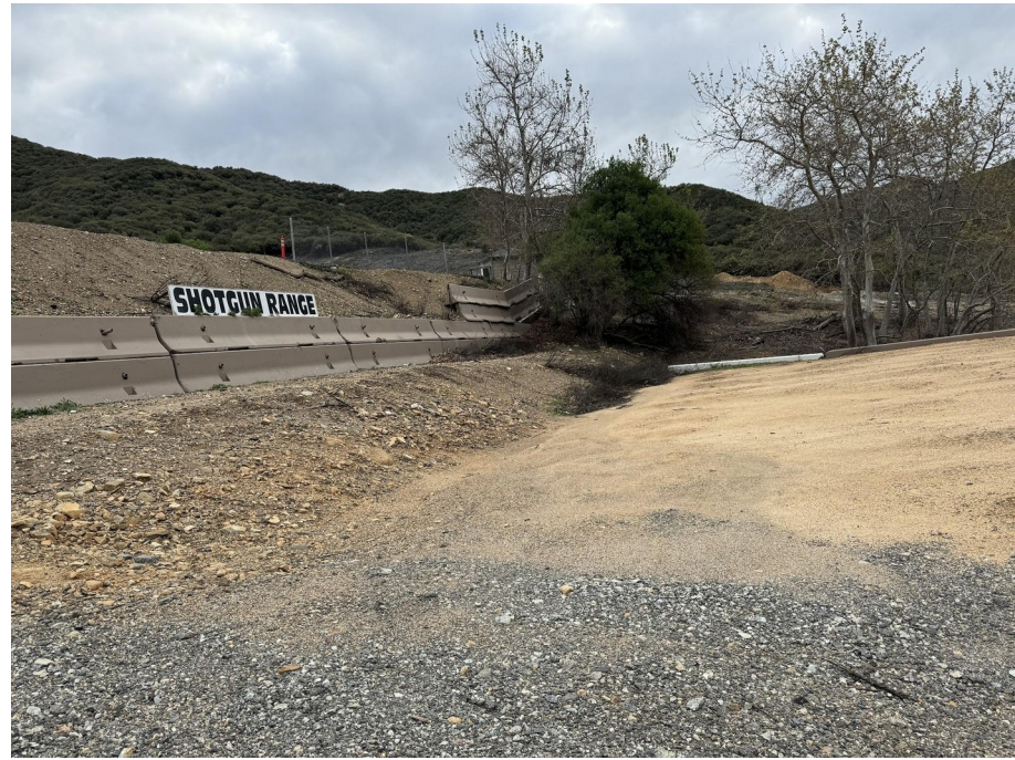
Shotgun range and parking