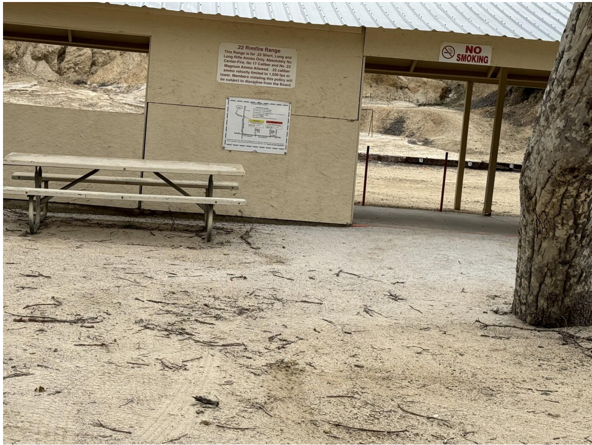
Times and rules