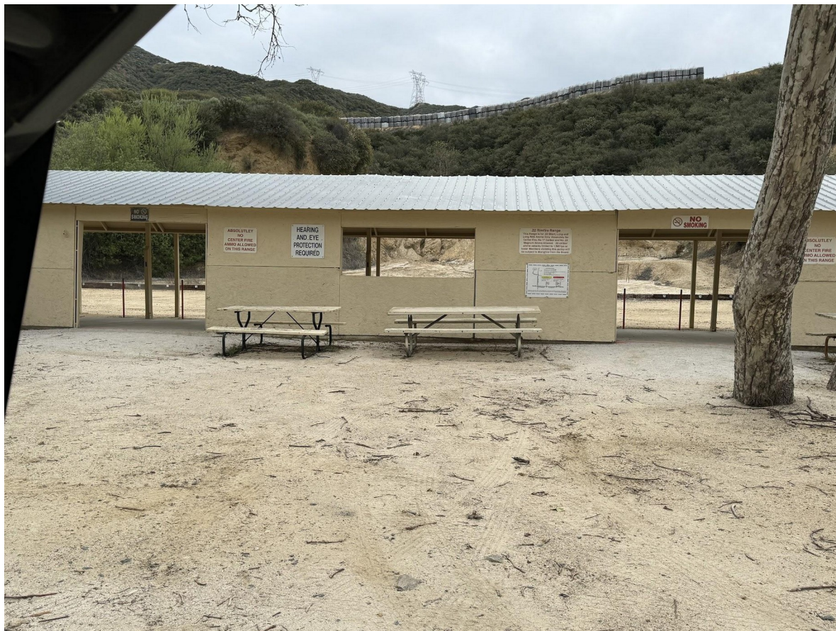
Youth rimfire .22