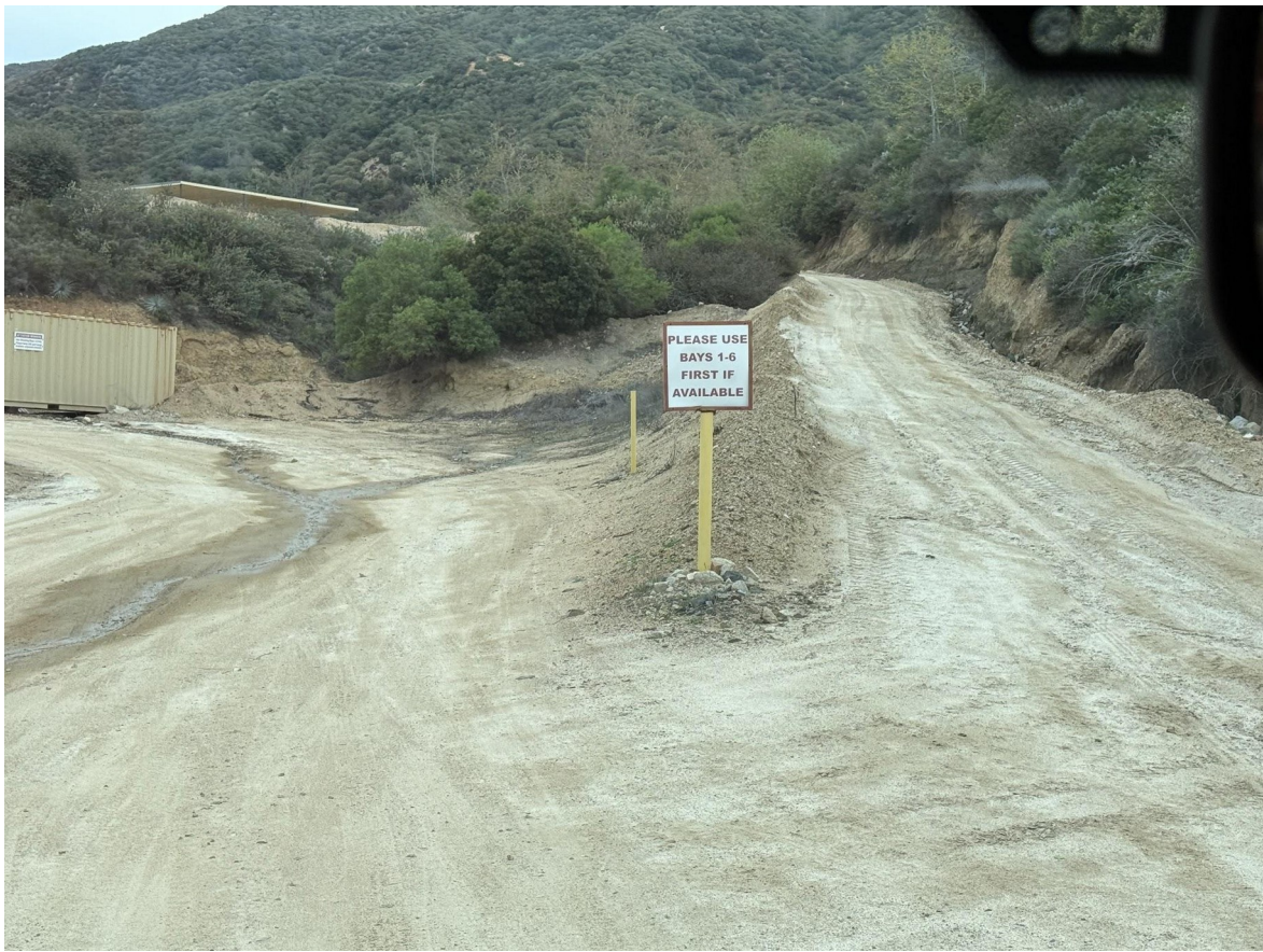
Back bays for long range