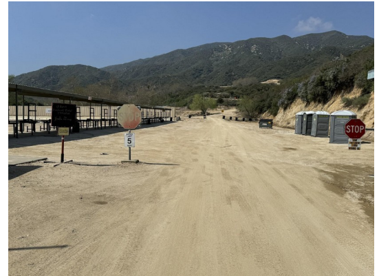
Main line procedures for when range staff are present and not present