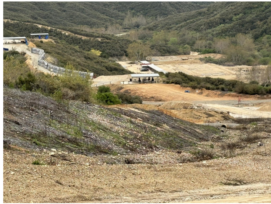
Impact view from impact