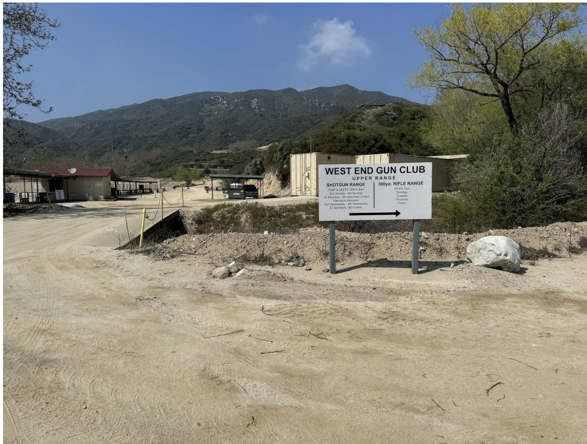
Road to upper range and hours of upper ranges