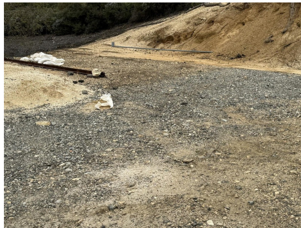
Road to shotgun and rifle