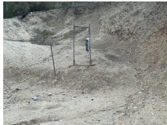
Additional back bays