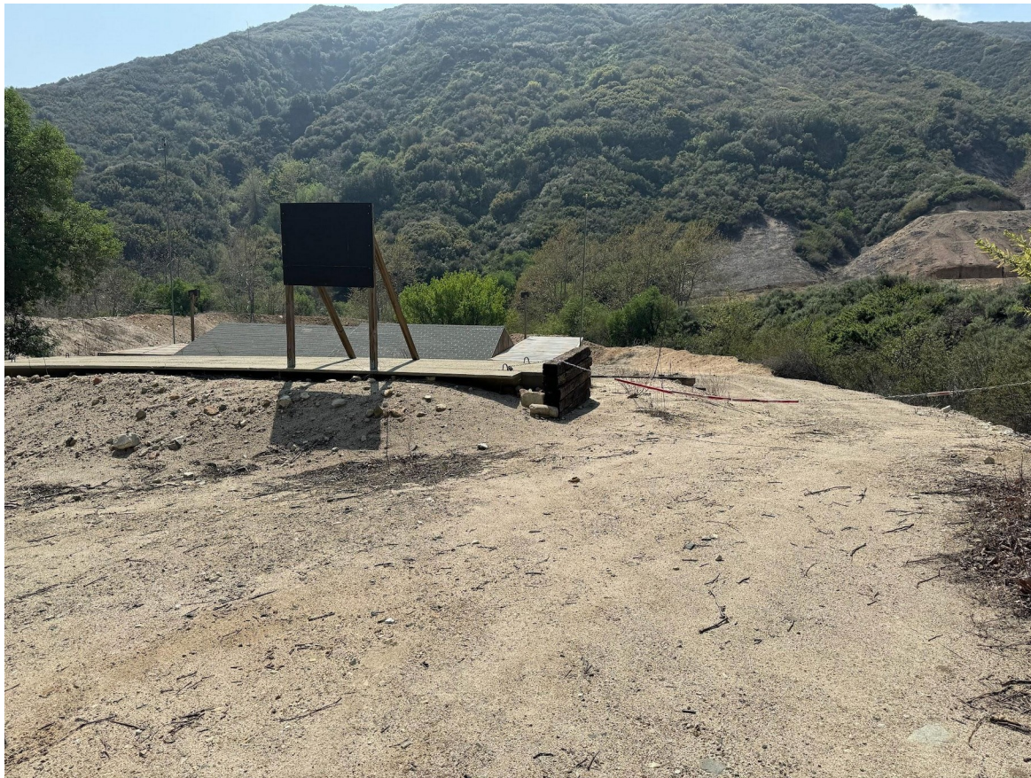
Top Gun bay