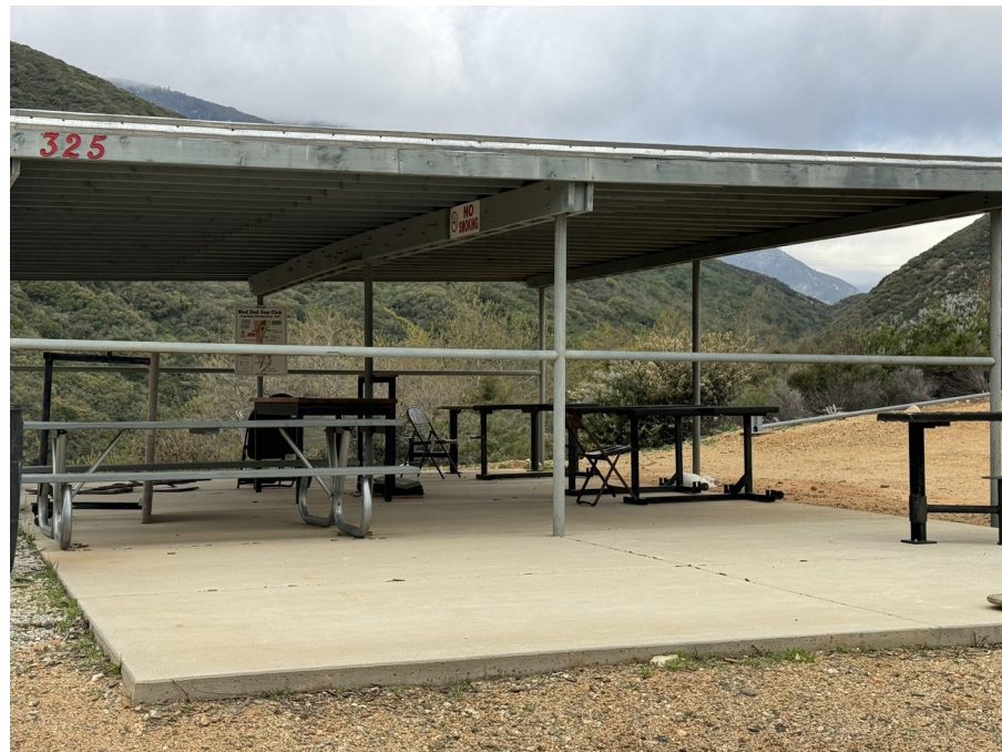
325, 450, and 500 yard ranges